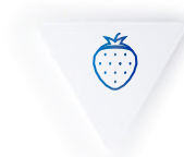
Fruit processing, packaging, and marketing for domestic and international markets