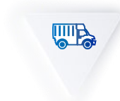
Agricultural logistics services

Our environmental law team has assisted clients in the following areas of the AAF sector: