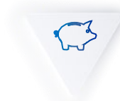
Piggery and breeding services