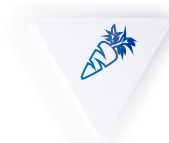
Commercial fruit & vegetable farming