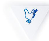
Poultry and beef cattle farming