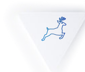
Hunting and game farming