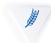
Grain production and trading