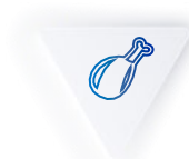
Meat preparation and sale