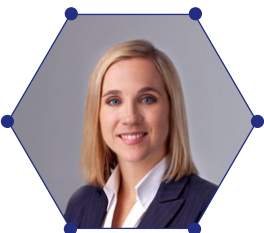
Bridget King Band 2

The 2020 FinTech edition saw Chambers expand its research from 22 jurisdictions to 37. This expansion reflects the global growth of this sector. As a firm, we are proud to be recognised as the South African leaders in this innovative and growing speciality.